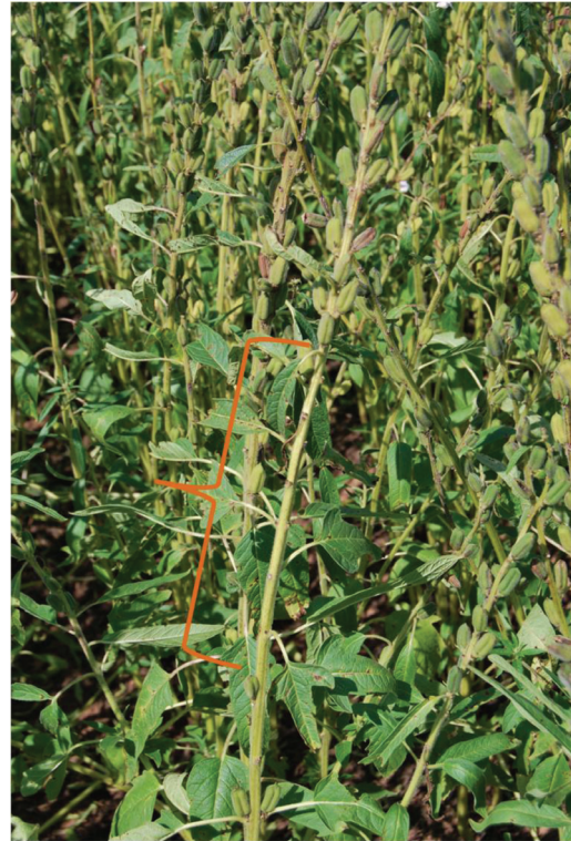
Figure 3. An example of the injury caused by an application of Select Max during sesame flowering. The flowers between the orange bracket did not form capsules, leading to a substantial reduction in yield.

Select®, Select Max®, and other products that contain clethodim must be applied before the flowering stage of