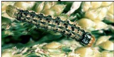
Fall Armyworm ( Spodoptera frugiperda ).