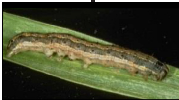
Corn Earworm ( Helicoverpa zea ).