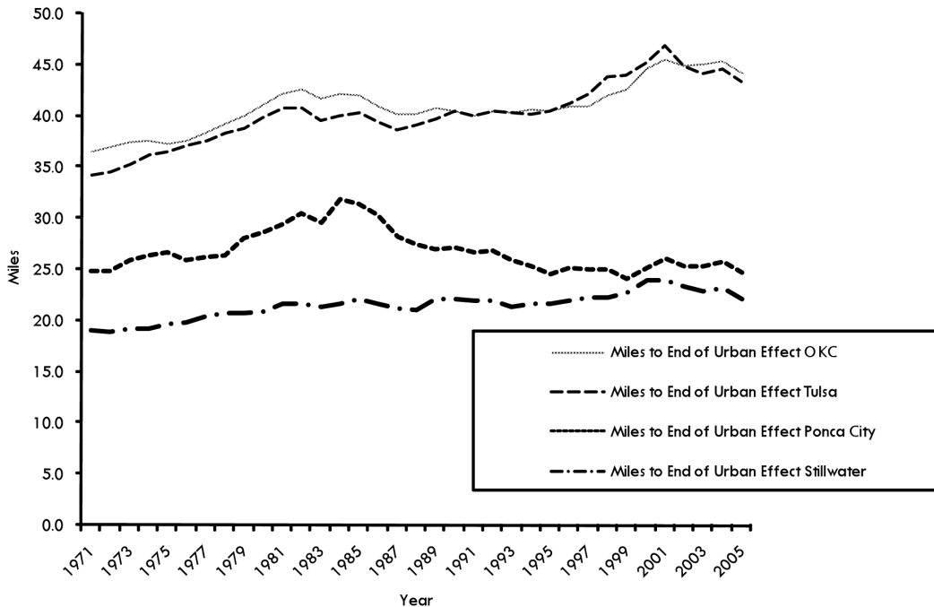
Figure 2. Distance to the end of the urban effect.