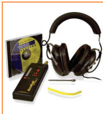
Figure 3. VPE Ultrasonic leak detector, about $900 at www.monarchinstrument.com .