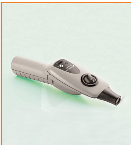
Figure 2. Inficon “Whisper” ultrasonic leak detector, about $270 at www.reliabilitydirect.com .