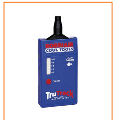
Figure 4. Robinair 16455 Ultrasonic leak detector, about $300 at www.valuetesters.com .