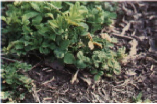
Figure 1. Stem nematode symptoms on four-year old alfalfa. Note the stunting and the crinkled leaves.