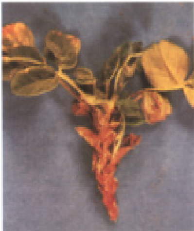
Figure 2. Alfalfa stem nematode symptoms on an alfalfa stem. Note the crinkled leaflet and swollen internodes.

to the OSU Plant Disease Diagnostic Laboratory. Avoid exposing bagged samples to excessive heat or cold so that the nematodes remain alive until the sample reaches the lab. Refer to OSU Extension Facts F-7610 for the correct way to collect and submit nematode samples.