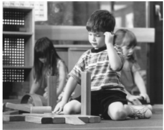
A child's curiosity should be encouraged through all stages of development.