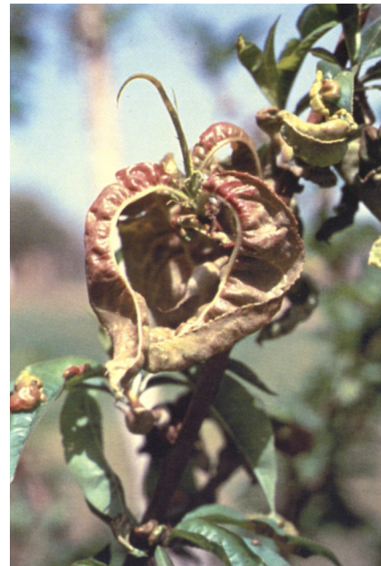
Figure 2. Peach leaves infected by the leaf curl fungus. Note puckering, deformation and change in color. Color changes usually occur long after initial infection.

The leaf curl fungus not only infects leaves, but also tender growing shoots and, more rarely, blossoms and fruits. Infected twigs become slightly swollen, may be yellowish and remain stunted. Infected blossoms and fruit usually fall early in the season. However, some infected fruit may remain in the trees. Diseased fruit will show shiny, raised, warty, discolored areas (Figure 3).