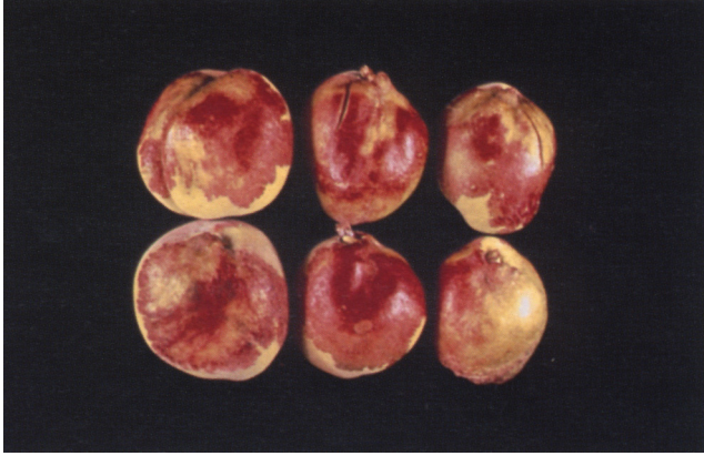
Figure 3. Fruit infected by the leaf curl fungus.