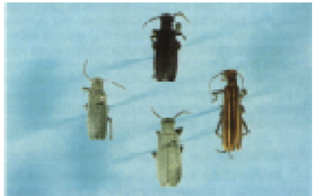
Figure 2. Black, spotted, striped, and gray blister beetles are representative of the many species in the U.S.

the larvae immediately begin searching for grasshopper eggs to consume. Grasshopper eggs are laid in clusters of up to 30 or more within 1 to 2 inches of the soil surface during the late summer and fall. Blister beetle larvae devour clusters of eggs, then overwinter in the soil and emerge as adults in late spring or early summer. When infesting alfalfa, beetles prefer to feed on blossoms but will feed on leaves if blossoms are not present. Pigweed, goldenrod, goathead, puncturevine, peanuts, soybeans, and many other plants also serve as hosts for these beetles.