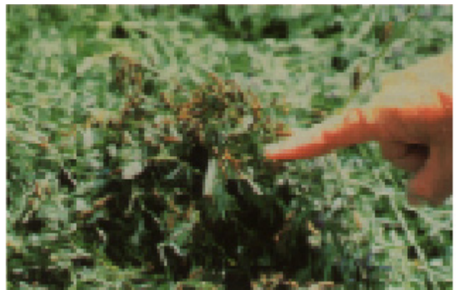
Figure 3. Typical swarm of striped blister beetles found on alfalfa hay.