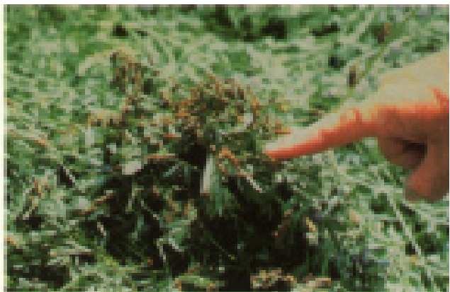
Figure 3. Typical swarm of striped blister beetles found on alfalfa hay.