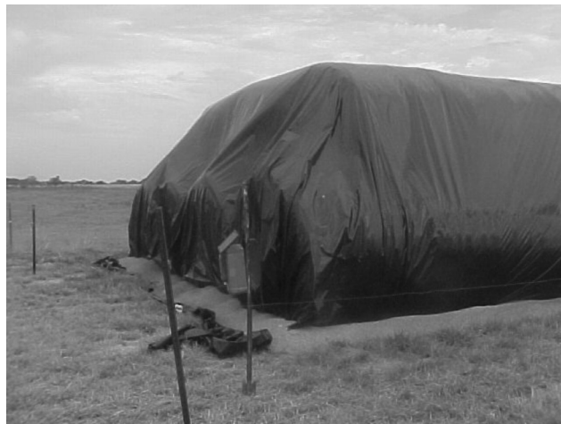
Figure 1. Black plastic sheeting (6 mils thick) covering hay.