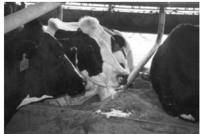
Heat stress is a seasonal factor that decreases dry matter intake and can affect milk production and composition.

Age (Parity): While milk fat content remains relatively constant, milk protein content gradually decreases with ad-