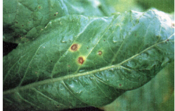
Fig. 6. Black spot on turnip leaf. Note the dark rings within and yellow borders surrounding the spots.

Anthracnose has been reported to occur in Oklahoma, but recently has been a minor problem. The disease is most severe on turnip, but can also attack kale, collard, mustard, and turnip x mustard. The fungus persists in infested crop residue and crucifer weeds but also may be carried on seed. Warm (79 to 86°F), wet weather favors infection and disease development.