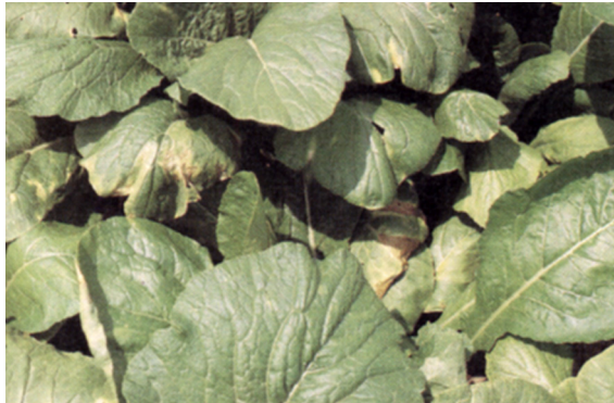
Figure 1. Turnip with V-shaped lesions at the leaf margins caused by black rot.

Symptoms - Plants at any stage of development are susceptible. Seedlings from infected seed die quickly and serve as sources of the bacteria that infect other plants. On true leaves, the disease is easily recognized by the presence of yellow V-shaped lesions extending inward from the leaf margins (Figure 1). The center of the lesion dries out and turns brown, and veins within the lesion appear blackened. The lesions extend into the leaf, killing large areas of affected leaves. Older leaves with lesions may develop numerous black, oval spots on the petioles and soon drop from the plant. Cutting into stems and petioles of severely affected plants reveals a black discoloration of the vascular system.