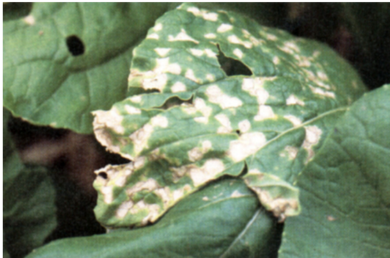
Fig. 4. White spot on turnip leaf with typical circular white spots.