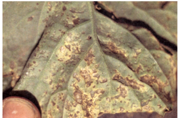
Fig. 2. Water-soaked spots on lower side of turnip leaf are typical of bacterial leaf spot and peppery leaf spot.

Symptoms - The name peppery leaf spot refers to the tiny leaf spots caused on cauliflower. On leafy greens, leaf spots range in size from tiny lesions (1/8-inch) to larger, spreading lesions that are angular and confined by the leaf veins (Figure 3). The center of the spots is grey to light brown and spots are