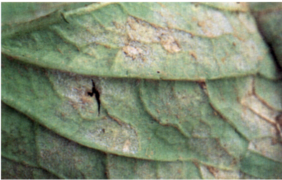
Fig. 8. White mildew on lower side of turnip leaf caused by downy mildew.