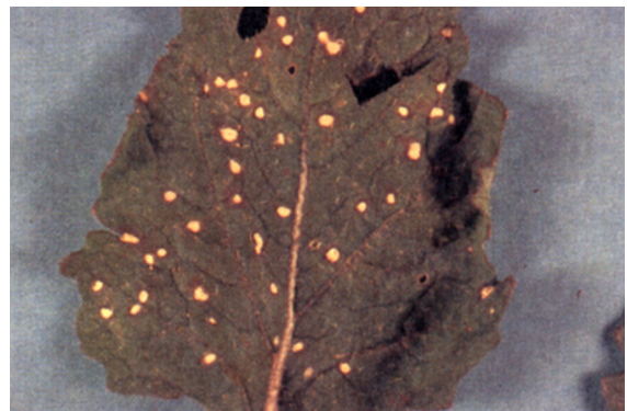
Fig. 7. Anthracnose on turnip leaf showing small circular spots.