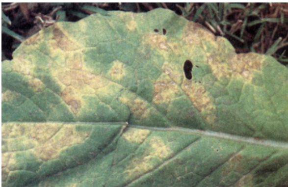
Fig. 9. Yellow leaf spots on upper side of turnip leaf caused by downy mildew.

White rust is a chronic disease problem for spinach production in Oklahoma. White rust of crucifers, which is caused by a different species of the white rust fungus, has not been severe in Oklahoma, but has been reported. The fungus persists in soil as resistant spores that can survive for many years and initiate disease cycles. Thereafter, disease increases from airborne spores that spread within and between fields. Cool (60 to 77°F) and wet weather is favors infection.