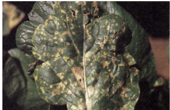
Fig. 3. Peppery leaf spot on upper side of turnip leaf. Note the angular shape of the spots.

usually surrounded by a yellow border. On the undersides of leaves, spots are first water-soaked and then dry and turn brown in color (Figure 2). Severely infected leaves or areas on leaves turn yellow before dying.