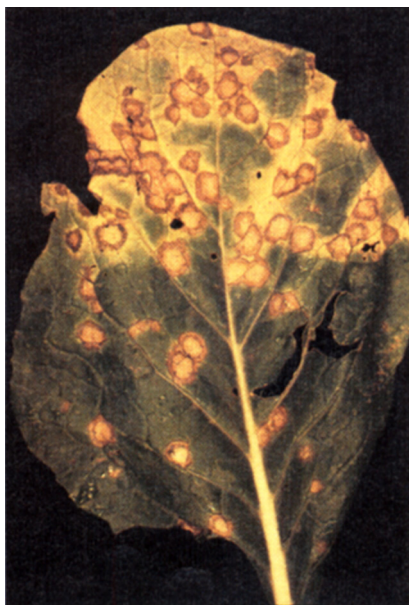
Fig. 5. White spot on turnip leaf producing circular spots with dark borders.

Black leaf spot is less common than white leaf spot in Oklahoma, but it can be a problem on turnips and collards. The fungus can be carried on seed, but also persists in infested crop debris and alternate weed hosts. Spores of the fungus are spread mainly by wind and splashing rain. At least nine continuous hours of dew or rain are required for infection. Optimum temperatures for infection range from 75 to 82°F.