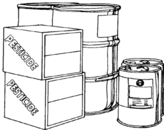
Figure 3. Store Pesticides with Label Plainly Visible.

All pesticide containers should be checked often for corrosion, leaks, and loose caps or bungs. These dangerous conditions must be corrected immediately. You may be able to position or rotate a can or drum that has been punctured to put the hole on top to stop the content from escaping, or you should put the pesticide in a sturdy container that can be sealed.